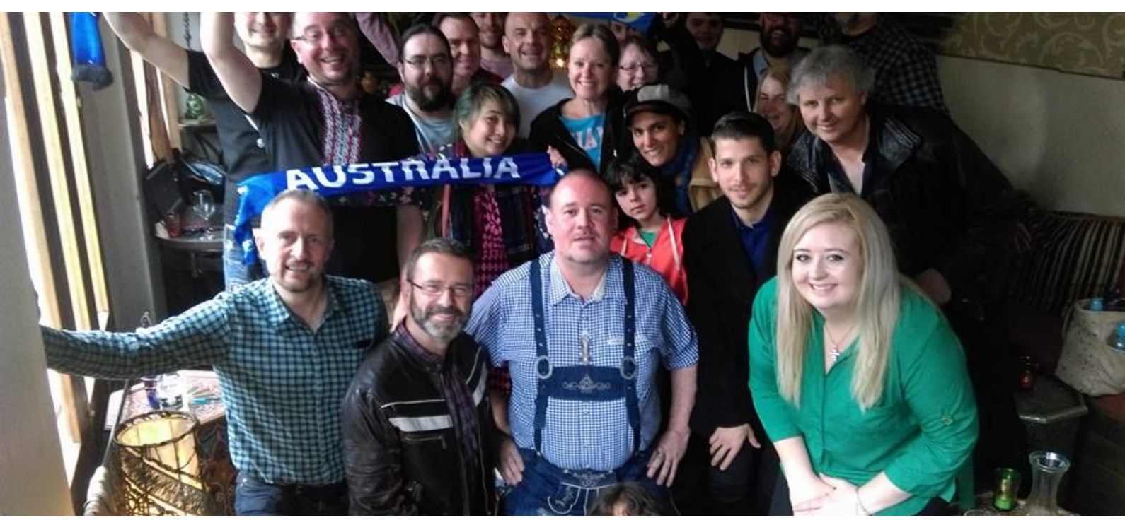
ESCFAN Members Second Chance meet in Melbourne, October 2016

The club exists to meet the needs of a growing ESC fan base within Australia, providing an outlet locally for fans to celebrate the contest on home soil through regular events, a central point for information about Australia's growing role at the contest (such as its broadcast and participation), and a conduit to further the knowledge and promotion of the event within the wider public.